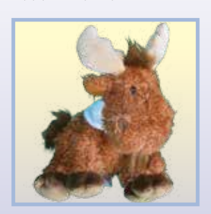
Moose I'll be watching.