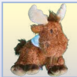
Moose I'll be watching.